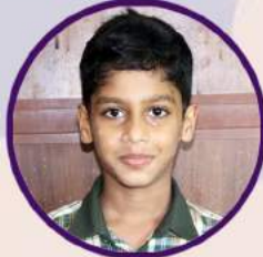
Imran A V VD